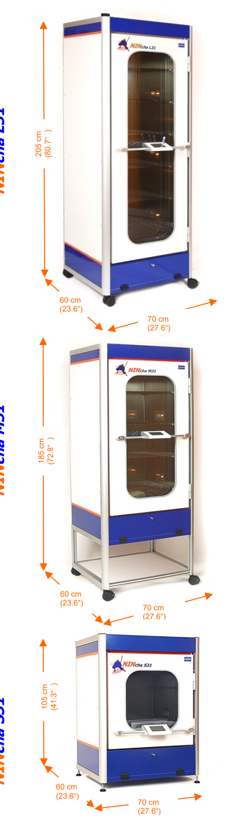
NINcha S31 is a desktop system with adjustable legs (above). An optional storage box BOX31 for any accessories not being used (below, left) is also available.

For each cabinet we offer a UV decontamination unit adapted in power output to the cabinet size (below, right, e.g. UVC-X1 for NINcha M31 ).